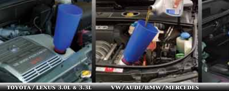
TOYOTA / LEXUS 3.0L & 3.3L