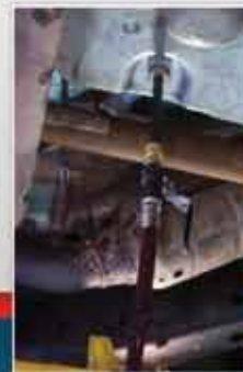
Ford Explorer Transmission Fill