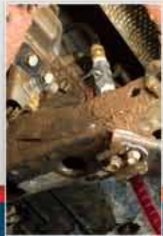
Toyota Transmission Fill