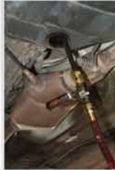
VW Transmission Fill